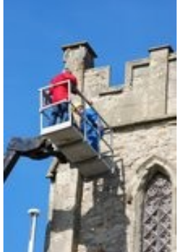
Above left: The Tower before the renovation work was completed. Above right: during the restoration.